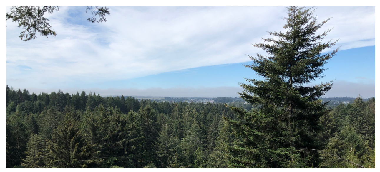
Overlooking what will be the Community Forest!