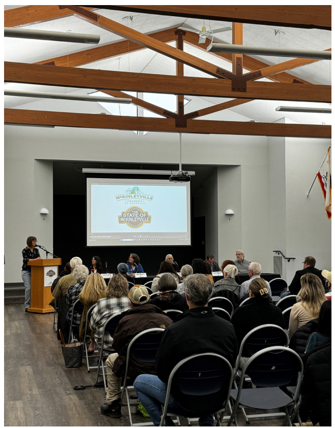
The State of McKinleyville in Azalea Hall on January 17, 2024.

My big news at the State of McKinleyville was that we are closing on the Community Forest land! The Trust for Public Land obtained a grant from the State to purchase the 599-acresfromGreenDiamond and Deed it to the MCSD. We closed on the land on January 31, 2024. Now the real work begins! One of our first tasks will be to finalize a Community Forest Committee consisting of MCSD Staff, forestry and other environmental professionals, and community members. We will finalize an application form for those interested in being on the Committee and circulate it on our website, etc. Look for the article in this Newsletter for additional